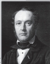
Härtmann, 46 år (af Constantin Hansen, 1851)

* Læs digte på side 10 / Read poems on page 10