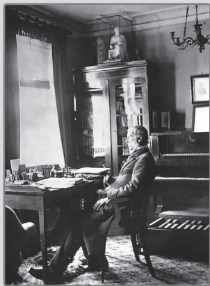
J.P.E. Hartmann fotografert i sit arbejdsværelse på bopælen Kvæsthusgade 3 i København, hvor han levede i mere end 70 år.